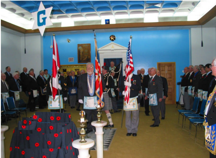
Brethren rise to form an Honour Guard and receive our Veterans