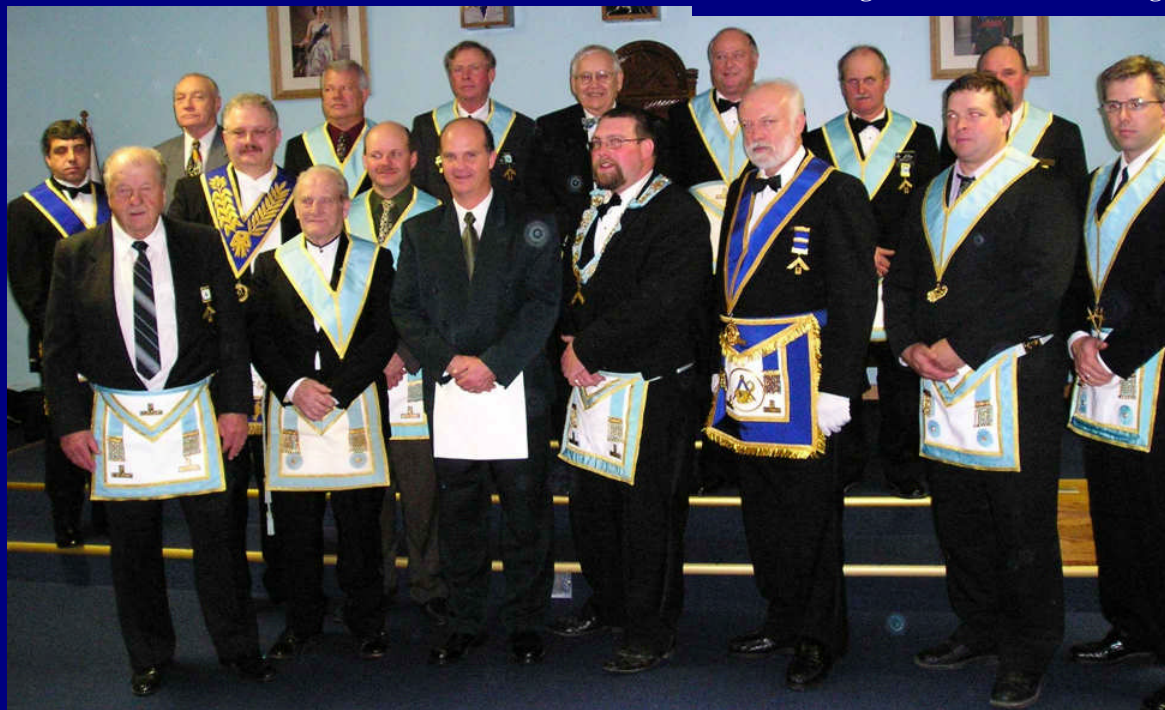
Gore Bay Lodge No. 472 Officers & Brethren gather for a photo with the District Deputy Grand Master.