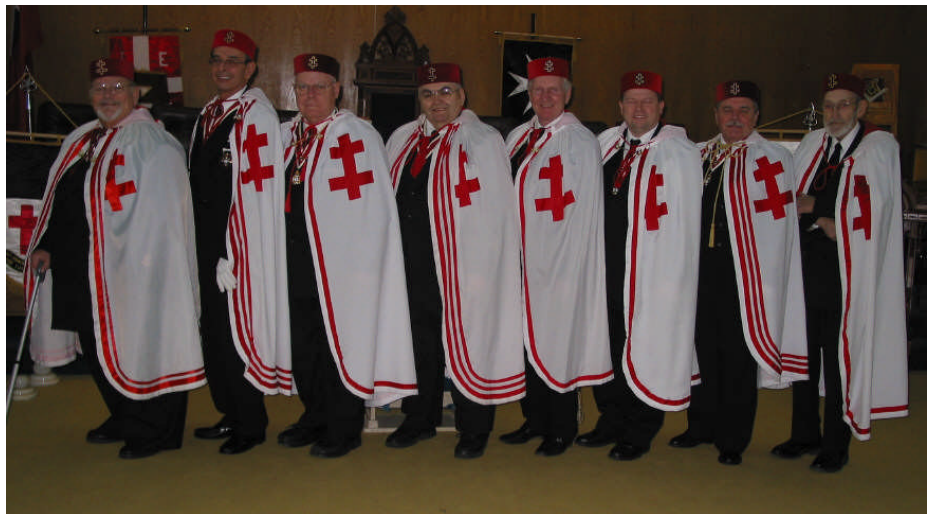
The Preceptors of Mavar assemble on the Level for their annual photo wearing the white mantle of the Knights Templar Order: